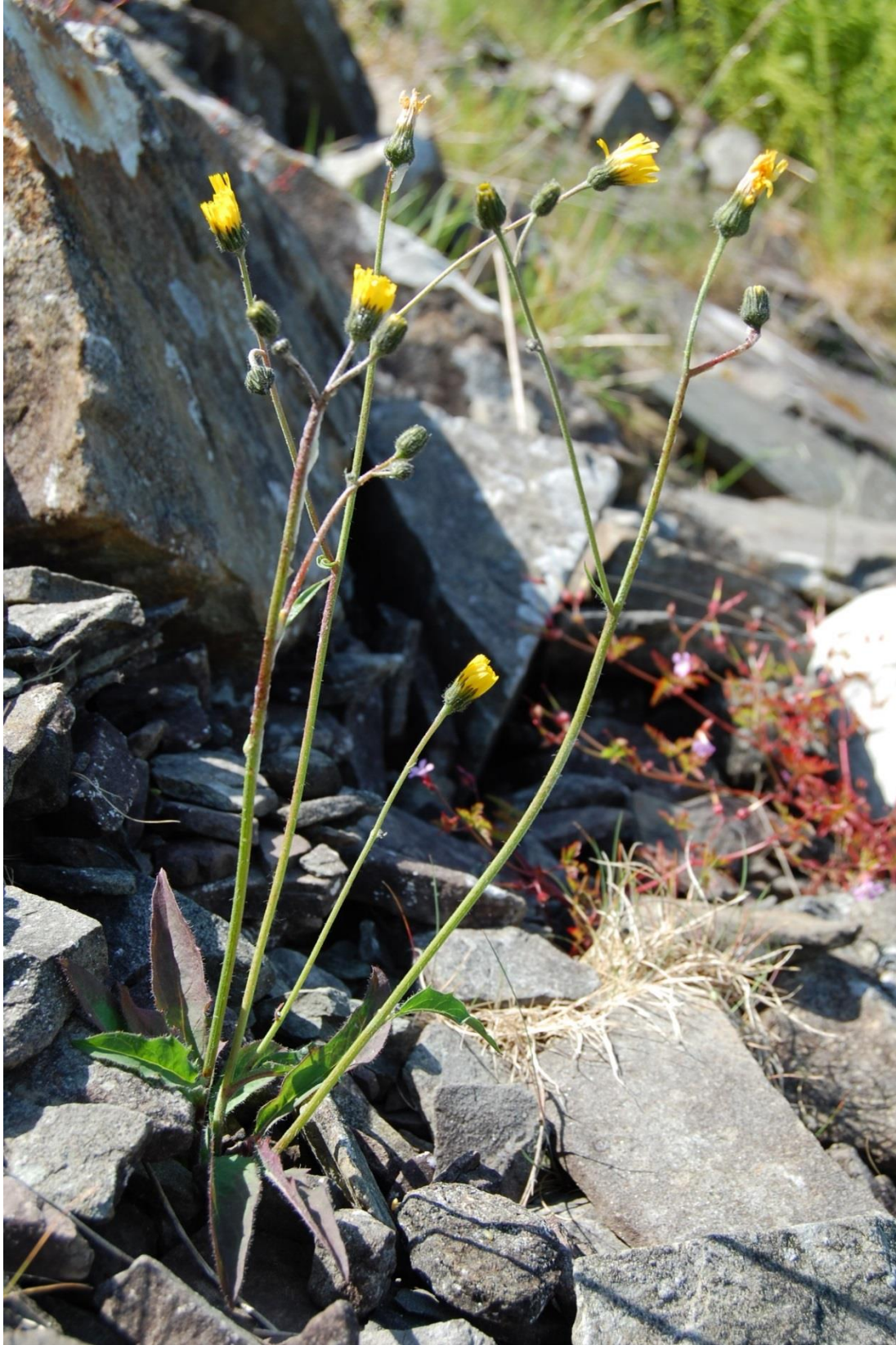
Figure 1. Hieracium angustatifforme plant on basic scree, Craig Cerrig-gleisiad, 23 June 2010.