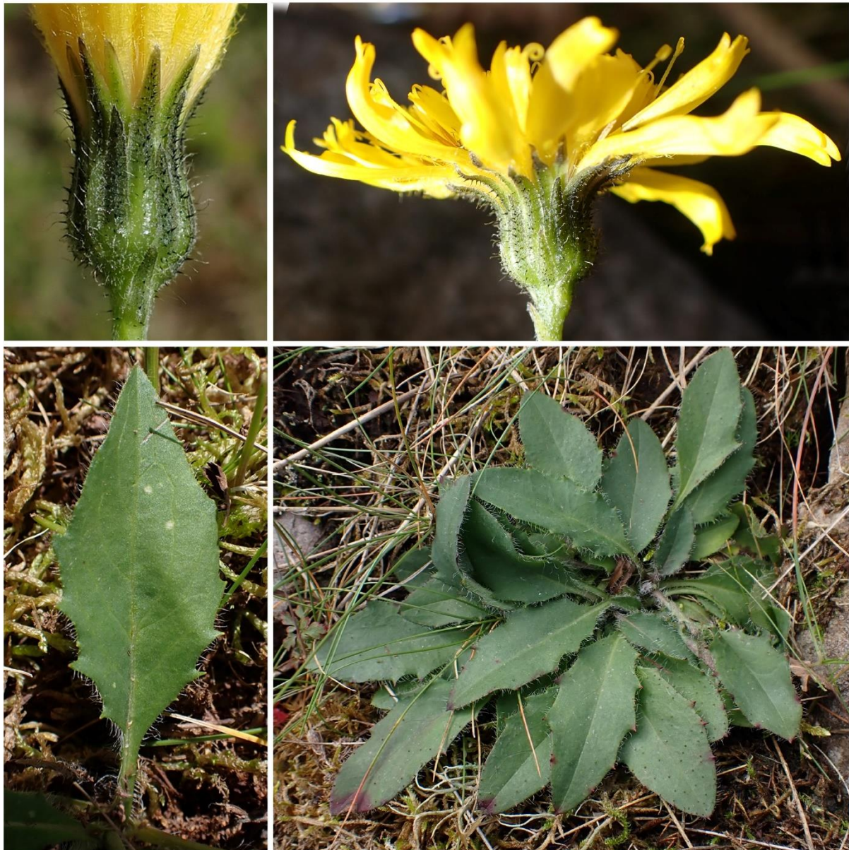
Figure 2. Details of Hieracium angustatiforme capitula and leaves, Craig Cerrig-gleisiad, 23 June 2010.