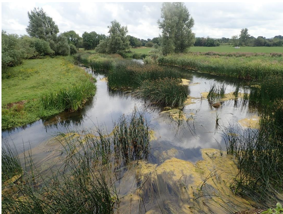
Figure 2. R. Suir at Camus Bridge, where S. × suecica grows in a stretch of river dominated by emergent stands of Schoenoplectus lacustris .