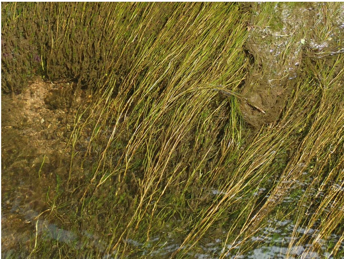
Figure 3. S. × suecica growing with Ranunculus in the S. branch of the R. Suir at Ardfinnan.

Further downstream, as the river deepened and broadened, S. × suecica became increasingly restricted to shallower stretches of the watercourse with more stony substrates than the main channel. Below Caher, at Swiss Cottage (S0522), the beds of Schoenoplectus are found along the banks of the broader and deeper channel. We found large beds of S. × suecica on the E. side, growing in stony shallows where the flow of the water was reduced by the dense beds of Schoenoplectus immediately upstream. These grew with Lemna minor , L. trisulca , Ranunculus sp., Spirodela polyrhiza and Fontinalis antipyretica . At Ardfinnan we could find no pondweeds in the broad northerly channel of the river, but a shallower branch to the south had large beds of S. × suecica in water 40 cm deep over limestone stones (Fig. 3), intermixed in places with beds of Ranunculus penicillatus subsp. penicillatus . The hybrid also grew in a stream which enters this branch of the river here, in water which in places was only 10 cm deep, accompanied by P. perfoliatus , Myriophyllum spicatum , Ranunculus sp. and (on slightly raised small stony mounds in the stream) Berula erecta (Fig. 4). Further downstream, at Newcastle Bridge (S1313), S. × suecica grew in water about 40 cm deep at the edge of an area of shoals and river shingle dominated by Phalaris arundinacea , with a few more non-flowering plants in a stagnant pond over the river shingle here.