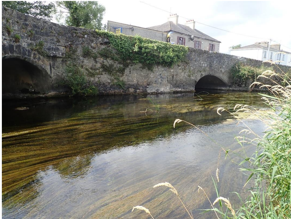
Figure 1. R. Suir at Golden, with large stands of S. × suecica in the foreground and Schoenoplectus lacustris (submerged leaves only) in the background.

Camus Bridge and Golden these were accompanied by the hybrid P. × nitens ( P. gramineus × perfoliatus ), also growing in the absence of both parents.