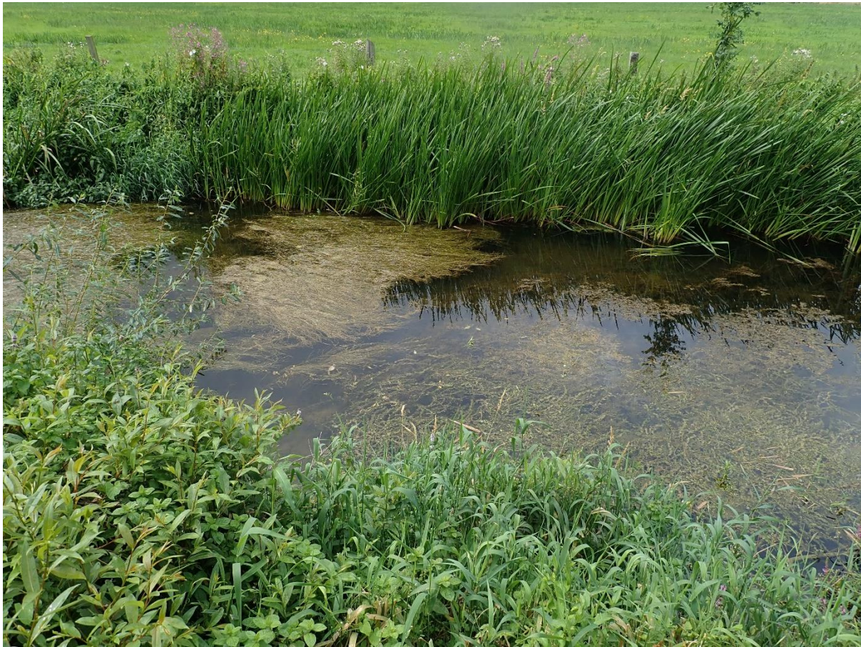
Figure 4. Stream flowing into the R. Suir at Ardfinnan, which supports stands of Potamogeton perfoliatus and S. × suecica .

The restriction of the hybrid to shallower water was most strikingly apparent at the most downstream locality we visited, at Knocklofty (S1420), where the river is the boundary between S. Tipperary and Waterford (v.c.H6). Upstream of the bridge the river is broad, smoothly flowing and tree-lined, with beds of Potamogeton × angustifolius ( P. gramineus × lucens ) and P. × nitens growing beyond the muddy margin on the Waterford side. However on the Tipperary side of the river downstream of the bridge the river breaks into shallows and there is a flowering stand of S. × suecica in water 5–20 cm deep (Fig. 5).