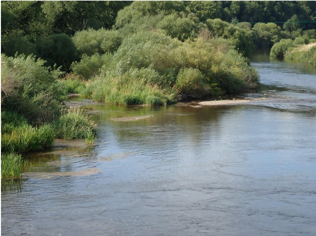
Figure 5. The R. Suir at Knocklofty. The river upstream of the bridge (top) has flowering stands of Potamogeton × angustifolius but no S. × suecica whereas downstream of the bridge (bottom) S. × suecica grows in the stony shallows.