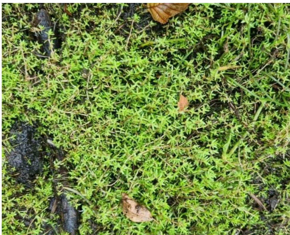
Figure 2. Crassula helmsii growing on the shore of Lough Gowna North

Crassula helmsii was found in two lakes surveyed in 2023, both of which are new records for this species. Lough Gowna (Latitude: 53.870917; Longitude: -7.573588) (v.c.H30) is a relatively large lake on the border between counties Cavan and Longford and is the uppermost lake on the River Erne system. Lough Gowna consists of two basins, with the South basin the larger and deeper waterbody. Crassula helmsii was found in both basins of this lake in 2023. In Gowna North it was found in its terrestrial form on the bank growing abundantly and luxuriantly along the southern shore of the lake basin (Fig. 2). It was also found at this location growing as an emergent in 0.2 m of water, 2.5 m from the bank. In Gowna South a very small amount of plant material was found growing fully submerged at 2.1 m depth, 75 m from the shore on the western side of the lake basin (Fig. 3A).