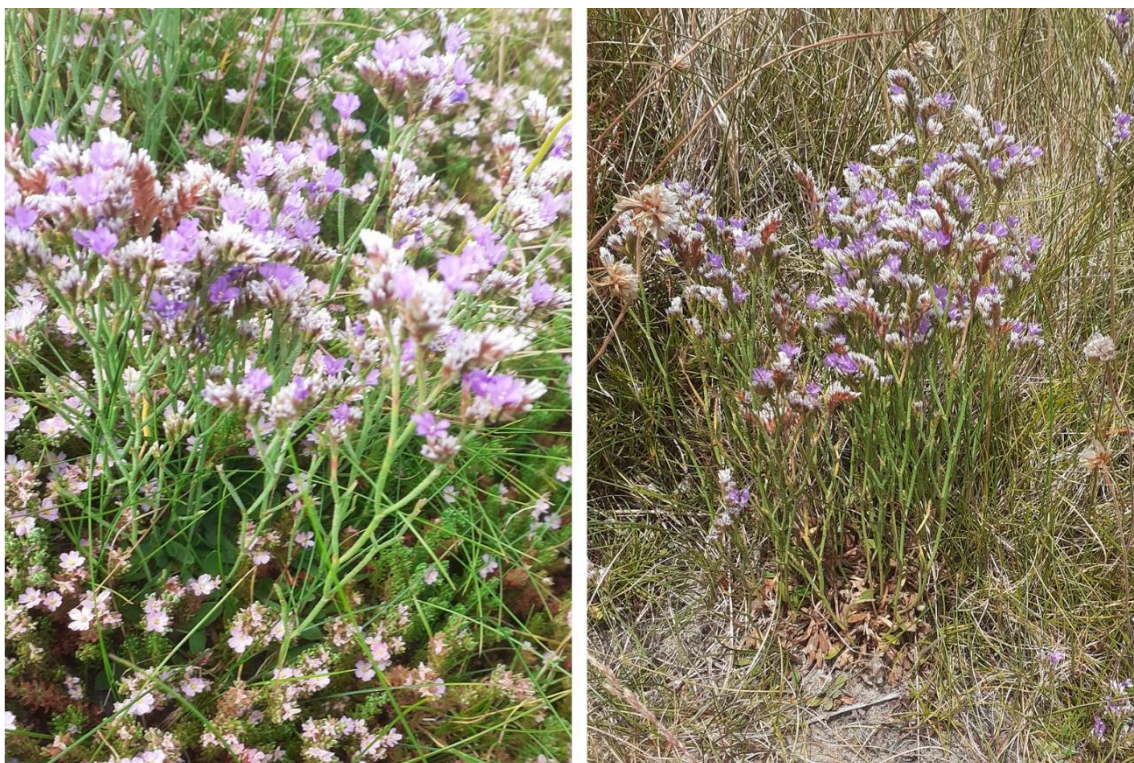
Figure 3. Left: clump of Limonium recurvum subsp. crigyllensis partly overwhelmed by spread of Frankenia laevis (Sea Heath) with rosette leaves largely obscured, 24/07/2021. Right: clump in taller grasses, under drought conditions, with most rosette leaves dead, 24/07/2021.

The Crigyll Estuary rough (verrucose) scape plants, named here as L. recurvum subsp. crigyllensis , mainly occur as compact clumps with multiple very densely packed rosettes. Many of the flowering stems are so closely spaced that they seem to entangle, resulting in the flower spikes lying close together (Fig. 3). Due to this the clumps have an overall appearance from a distance that differs from the more diffuse spike spacing typical of L. procerum (C.E. Salmon) Ingr. (Tall Sea-lavender), which is frequent at the same site. Some isolated rosettes putting up single rough scapes can also be found.