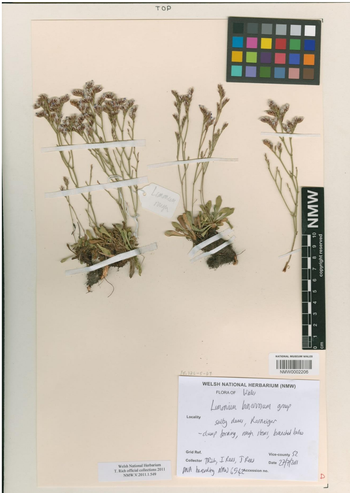
Figure 2. Scan of the holotype (left) of Limonium recurvum subsp. crigyllensis in the National Museum of Wales. Collected by T. Rich, I. Rees & J. Rees from the Crigyll Estuary, Rhosneigr 27/07/2011.