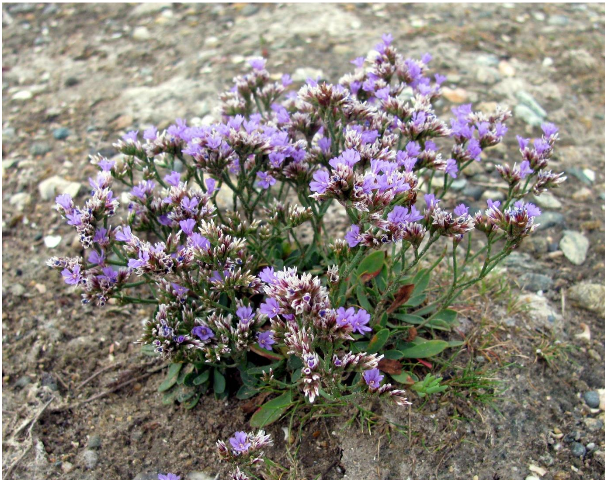
Figure 1. Limonium recurvum subsp. crigyllensis forming a compact multi-rosette clump on open sandy gravel in the Crigyll Estuary, Anglesey v.c.52, National Grid monad SH3174, 01/08/2013.

including at Portland Bill, Dorset v.c.9, the type locality for L. recurvum C.E. Salmon ( sensu stricto ) and at several disjunct localities with their own subspecies or varieties on the west and north coasts of Ireland.