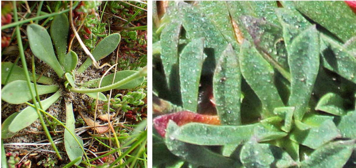
Figure 5. Comparison between (left) living rosette leaves of Anglesey Limonium recurvum subsp. crigyllensis and (right) Mull of Galloway L. recurvum subsp. humile.

One feature mentioned by Ingrouille & Stace (1986) as found in both L. recurvum subsp. pseudotranswallianum Ingrouille (from Co. Clare, v.c.H9) and L. recurvum subsp. humile was described as “outer bract coming to conceal inner bract towards the end of the spike”. The Crigyll plants with outer bracts that progressively cover a greater proportion of the inner in sequence would fit this description (Fig. 4). In further comments Ingrouille & Stace considered that subsp. pseudotranswallianum was closer to the Donegal segregants than to others found further south on the west coast of Ireland and that the Donegal ones were related to the Mull of Galloway ones. Baker (1954) had also commented on similarities between Donegal and Mull of Galloway forms.