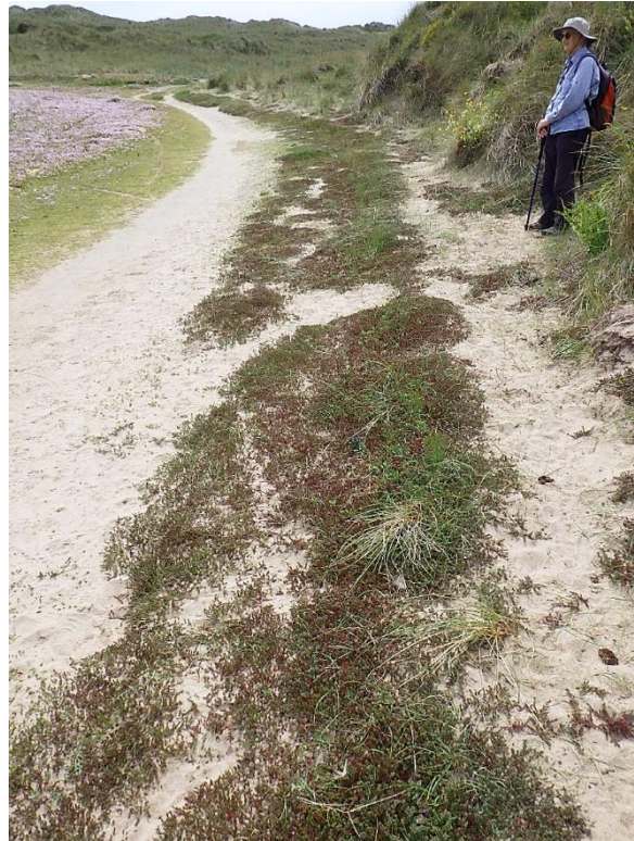
Figure 6. Ecotone strip of Frankenia laevis with L. recurvum subsp. crigyllensis growing within it, between saltmarsh and dunes SH317741, 19/06/2021.